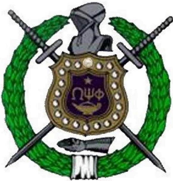
Omega Psi Phi