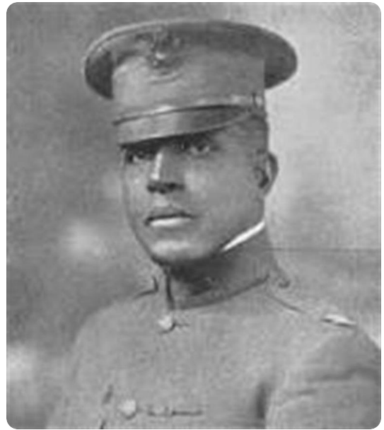
Col. Charles Young